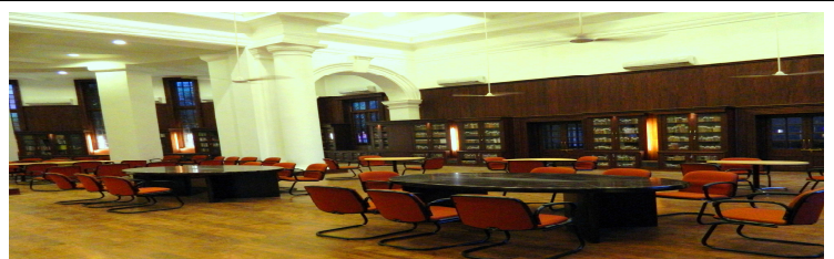
Kanika Library, the oldest library of the state 1922

Ravenshaw University came into existence on the 15th day of November, 2006. It was an upgradation of Ravenshaw College established in 1868. Ravenshaw is one of the oldest and largest colleges in India which subsequently became an autonomous college with CPE status by UGC and graded 'A' by NAAC. The College with all its glorious academic achievements and relentless scholarly pursuits had already created a distinct niche for itself in India and beyond. The history of this great institution is, in a manner of speaking, the history of modern Odisha. It was the cradle of ideas fostering national unity and nationalism, promoting social mobilization and gearing up the freedom struggle. The grand hall of this institution was a theatre of history on the 1st of April 1936. It was the venue for the declaration of Orissa as a separate province; thereafter it housed the state's first legislative assembly up to and even after Independence (1937-1952) till it was shifted to Bhubaneswar, the new capital of the State. During Quit India Movement of 1942, the students of this institution brought down the Union Jack as a mark of nationalistic fervor.