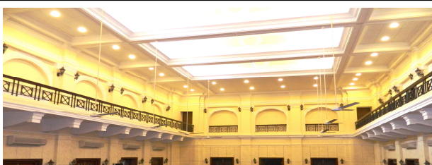
Provincial Assembly of Odisha from 1937-1952 (Heritage hall)